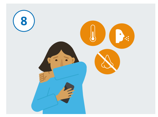
If you develop coranavirus (COVID-19) symptoms, make sure to record them in the NHS COVID-19 app and follow Government guidelines/advice.

You may get an alert if NHS contact tracers identify that you have recently visited a venue where you may have come into contact with coronavirus (COVID-19). If you are under 18, you are advised to show this alert to a trusted adult.