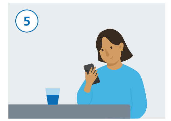
After scanning your QR code on the poster, you are now successfully checked in.