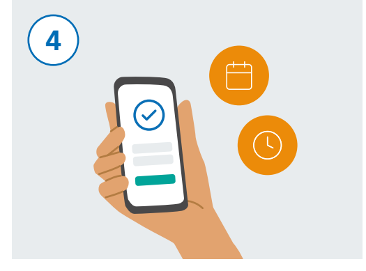
The time and date of your visit will be stored on the app. It will not be sent or shared with anyone else.