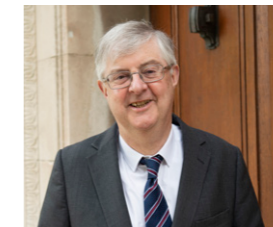
Mark Drakeford MS, First Minister of Wales